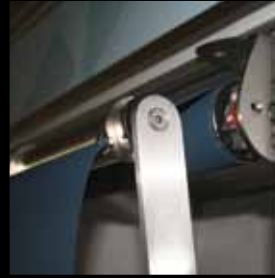
Unit Without Hood